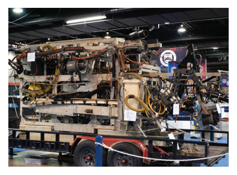
▲ The Ship of Gold display featured Nemo , a six-ton remotely operated submersible vessel used in the site excavation.